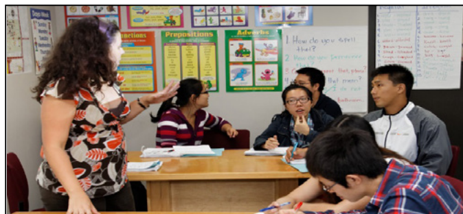
International Teaching Assistant Class