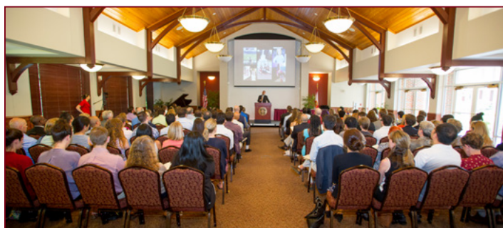
Attendees of the 2015 Celebration

The Graduate School recognized graduate students in the following categories: Program for Instructional Excellence (PIE) Teaching Associates, Preparing Future Faculty (PFF) Fellows, Preparing Future Professionals (PFP) Fellows, FSU Three Minute Thesis (3MT) ™ Winners, and recipients of external funding.